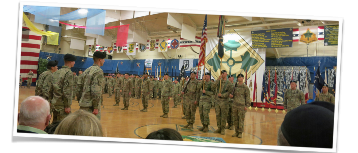
Above: Change of Command ceremony for the 2/12t^h

VIDEO PANORAMA OF THE EVENT LOCATION - <u>CLICK HERE</u>