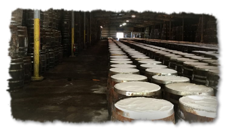
Frothy barrels of fermenting sauce await the final completion of the product we know as "Tabasco." The spicy sauce doctored many a dull C-Ration during the Vietnam War.