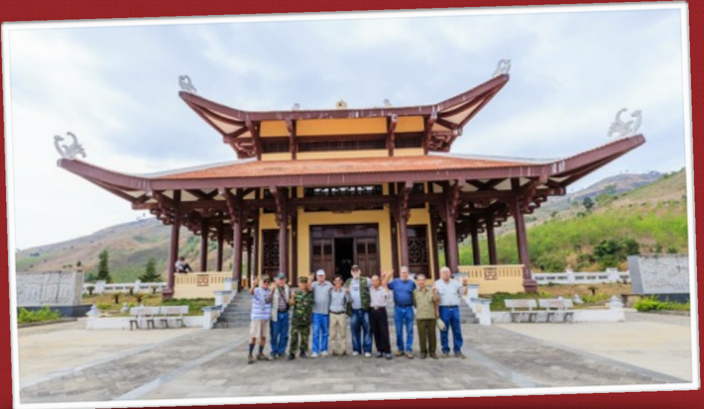
Vietnamese and American Veterans in front of "Memorial House" near LZ Brillopa8