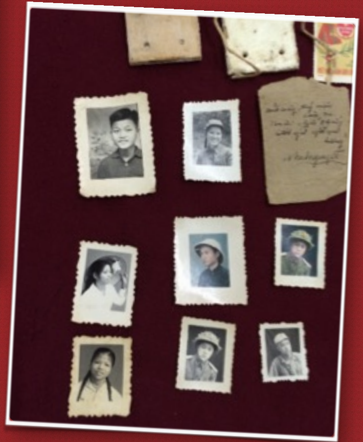
After 48 years, the wallet is handed over for return to the memorial and possible return to family of the fallen NVA soldier.