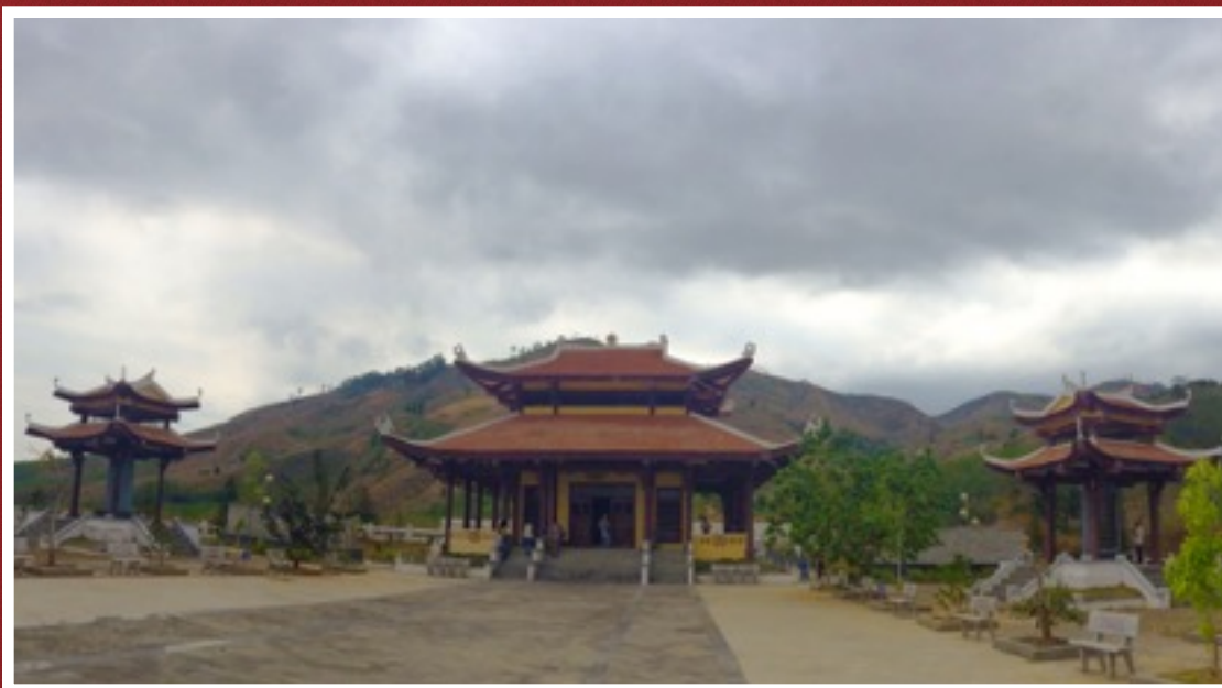
This memorial was built by North Vietnamese Veterans at the base of OP Hill and Brillopad. The hill to the left of the center of the building is OP Hill, with the Firebase just below it.