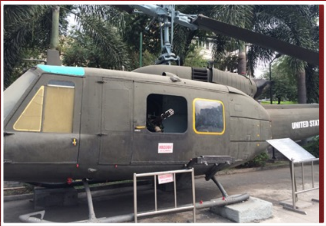
On display are many former U.S. military items.