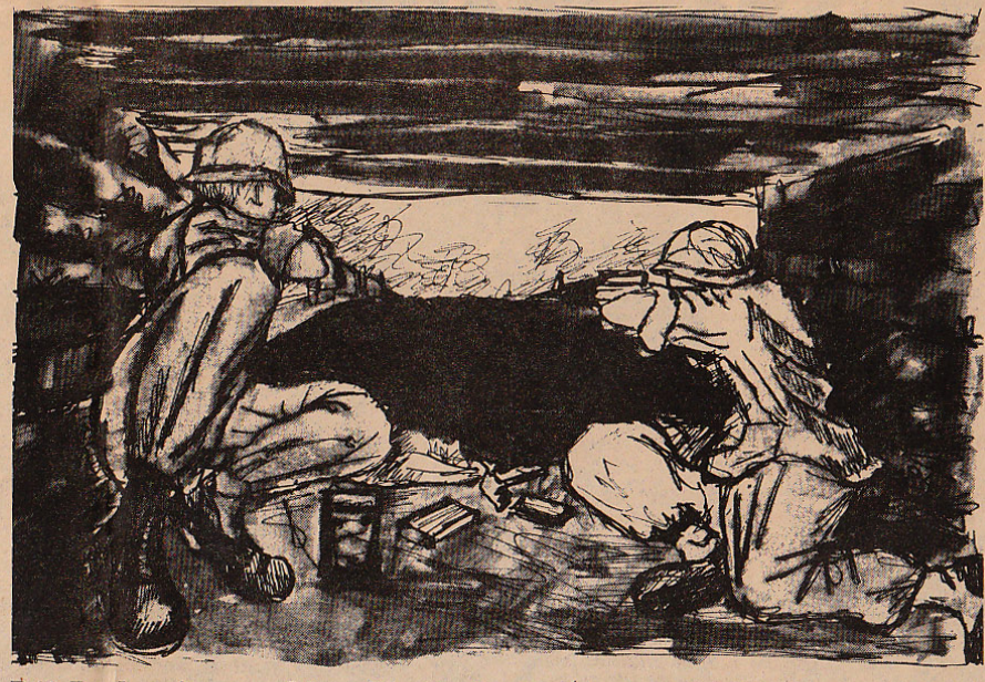
B40 Rockets Screamed Into The Bunkers...

A sweep of the area was made in the morning which turned up 248 CHICOM grenades, 43 B40 rockets, one dead NVA soldier and two AK47 rifles.